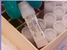
Used by the Center for Disease Control (C.D.C.) Atlanta, GA - USA.